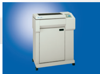
T6065 Enclosed Pedestal