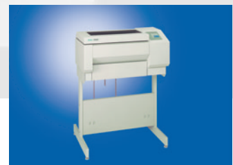
T6065 with Pedestal