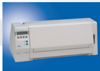
T2240: 9 or 24-wire, narrow carriage