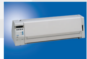
T2340: 24-wire, wide carriage